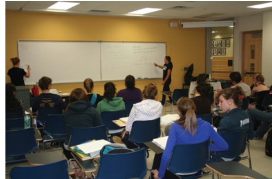
ABOVE: Grade 11 Functions Session

If you are interested in helping out as an academic course advisor, on our Waterloo High School advisory board, or as a sponsor of the initiative, feel free to contact us @ highschool@lauriersos.com